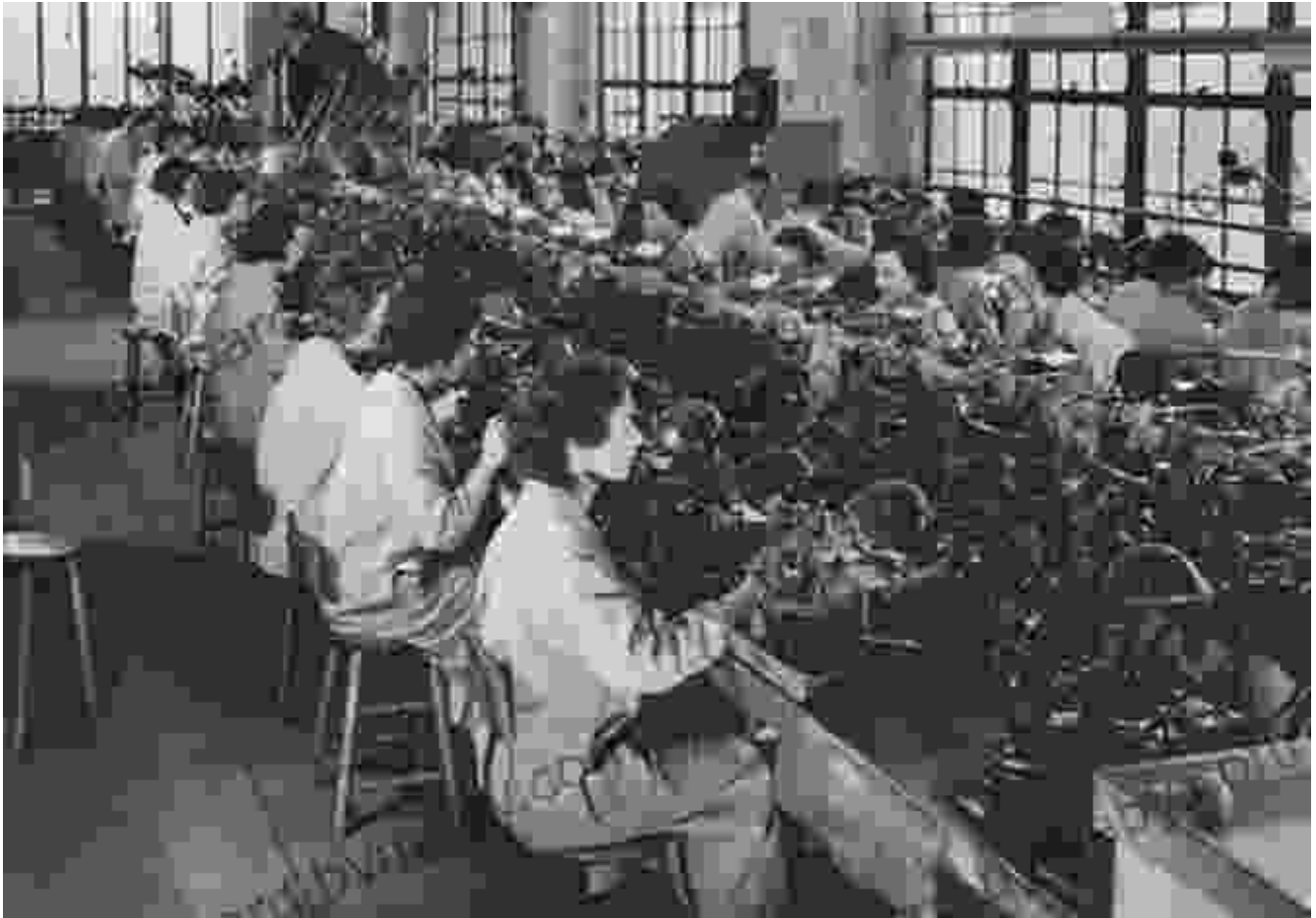
[Women working in the Pinon Department at Bulova Watch] by SMU Central University Libraries (1937)

https://www.flickr.com/photos/smu_col_digitalcollections/7095362809/