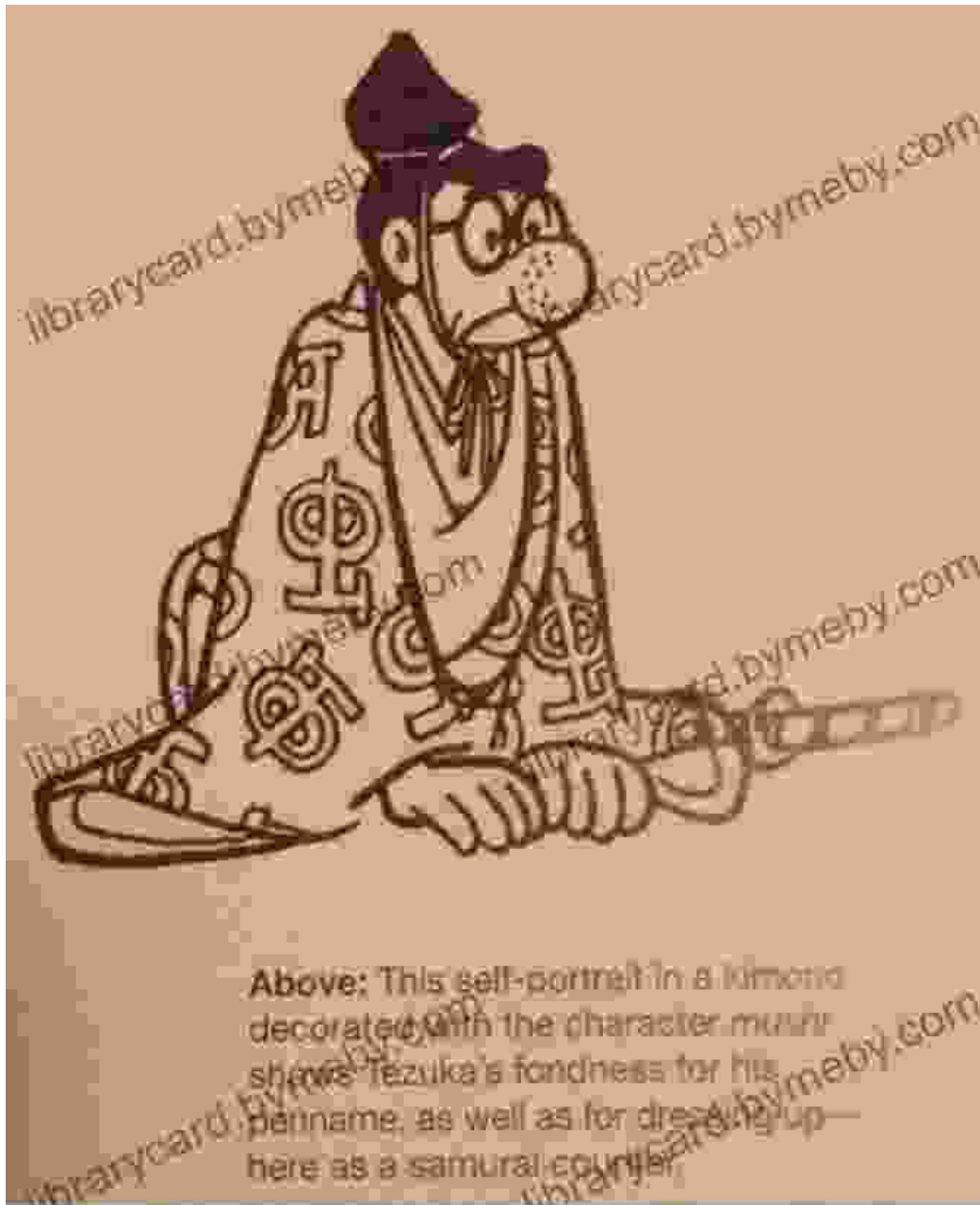
Above: This self-portrait in a kimono decorated with the character muvv shows Tezuka's fondness for his penname, as well as for dressing up—here as a samurai counselor.

Through his masterful storytelling and unforgettable characters, Tezuka invites readers to contemplate the complexities of life, challenge societal norms, and embrace the transformative power of self-discovery.