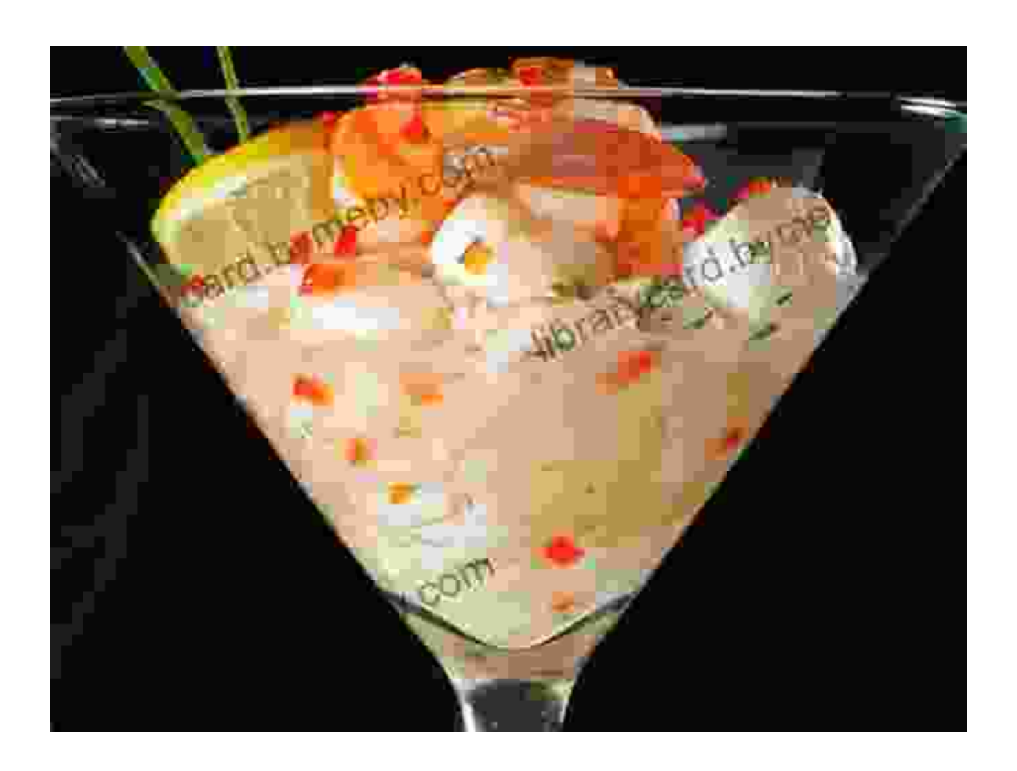
A Culinary Masterpiece for the Ages

For those seeking to recreate the magic of The Oakland Astoria in their own kitchens, the book offers an enticing collection of recipes. From the restaurant's signature Crab Louis to the delectable Oysters Rockefeller, these culinary treasures are meticulously detailed and accompanied by captivating stories and tips that bring the recipes to life.