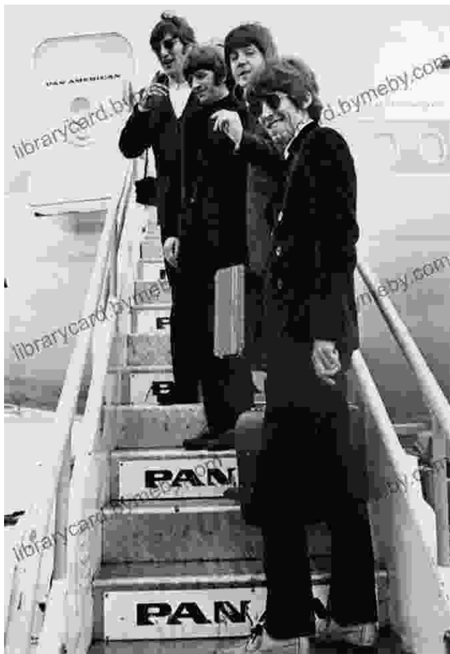
Paul McCartney leaving the Beatles.