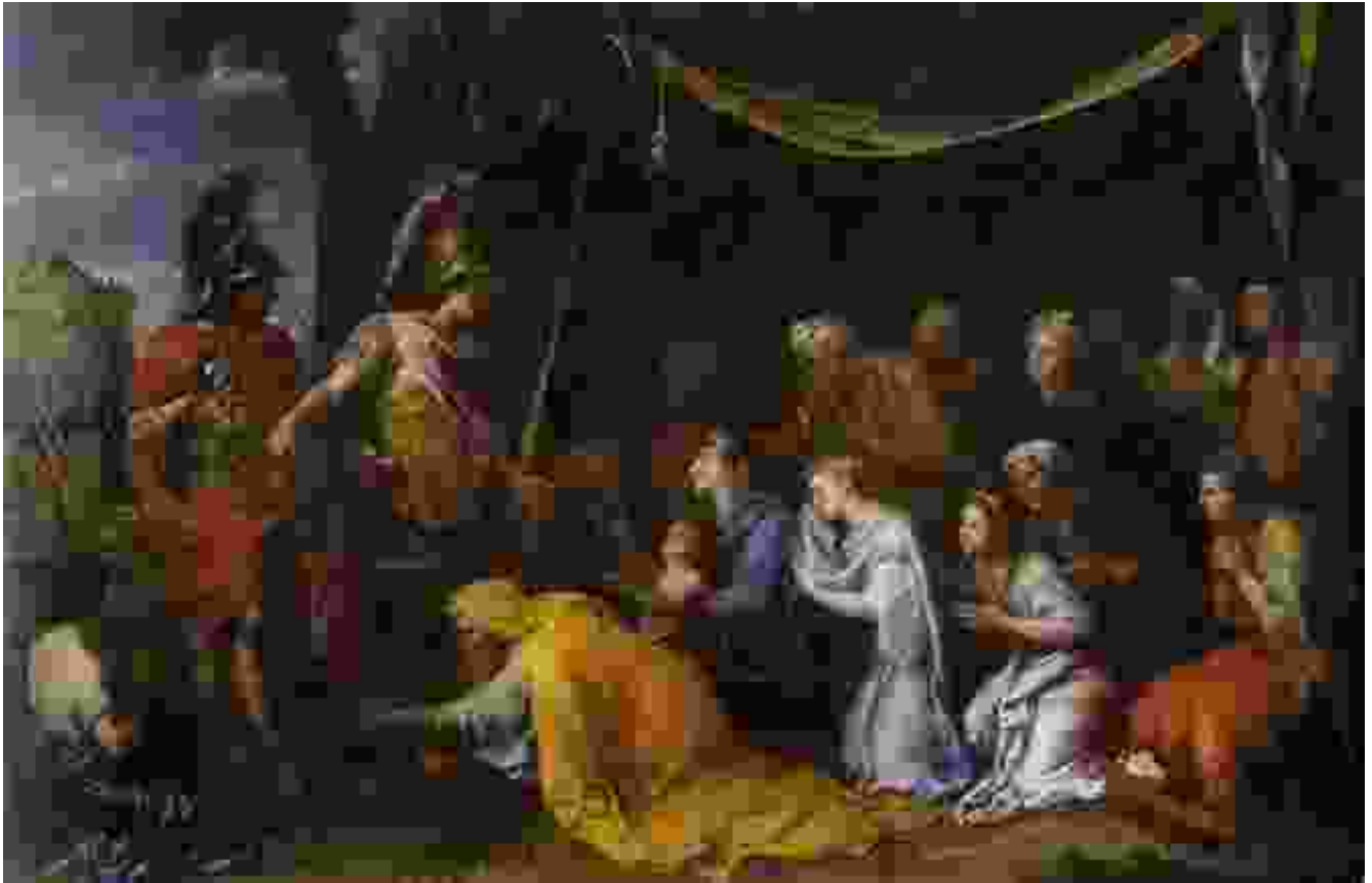
Painting by Charles Le Brun depicting Darius III surrendering to Alexander